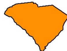
South Carolina SC

Bonus: These states are called the South Atlantic States .