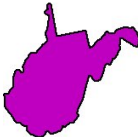
West Virginia WV