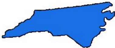
North Carolina NC