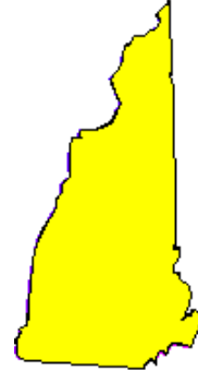
New Hampshire NH