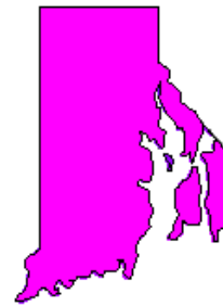
Rhode Island RI