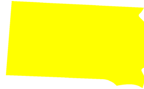
South Dakota SD