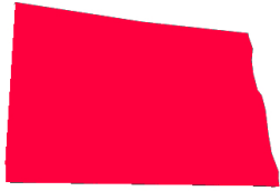
North Dakota ND

Identify each state and write the name of each state and its postal abbreviation. Use a United States map to check your answers.